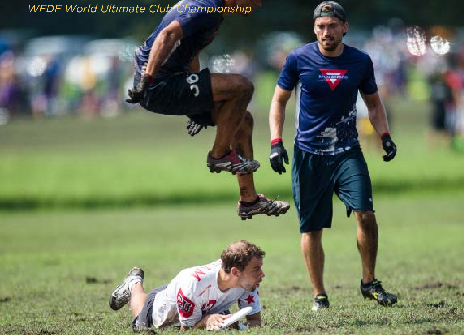
Clapham vs KFUM Örebro